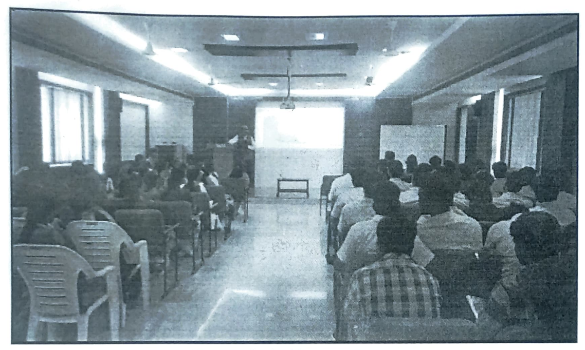
Presentation by Resource Person